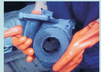
Rust free after 3 mins.