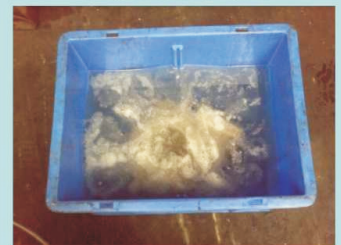
Dipped for removal